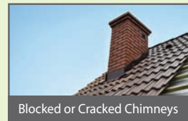
Blocked or Cracked Chimneys