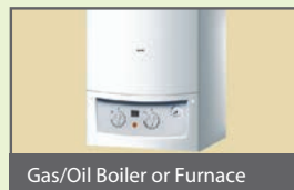
Gas/Oil Boiler or Furnace