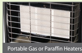
Portable Gas or Paraffin Heaters