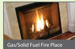
Gas/Solid Fuel Fire Place