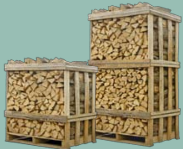
Half Pallet - 1m 3